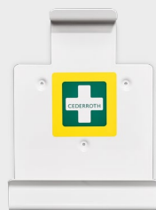
Wall Bracket REF 51000008

Anyone can provide first aid with Cederroth First Aid products. Our products are simply designed and come with clear instructions which means they can always be used by everyone, everywhere, in every situation.