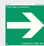
Escape Route Arrow REF 1735