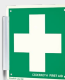
First Aid Cross REF 1738